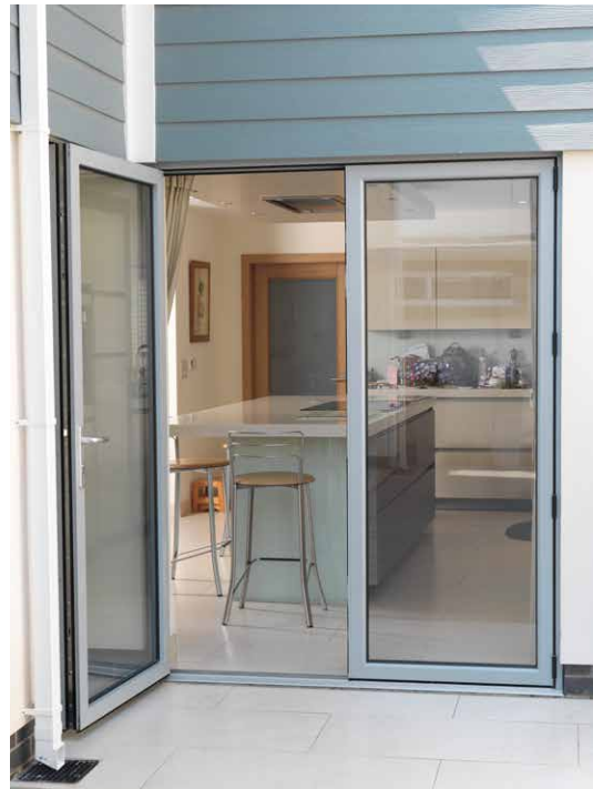
Alitherm Plus French Doors