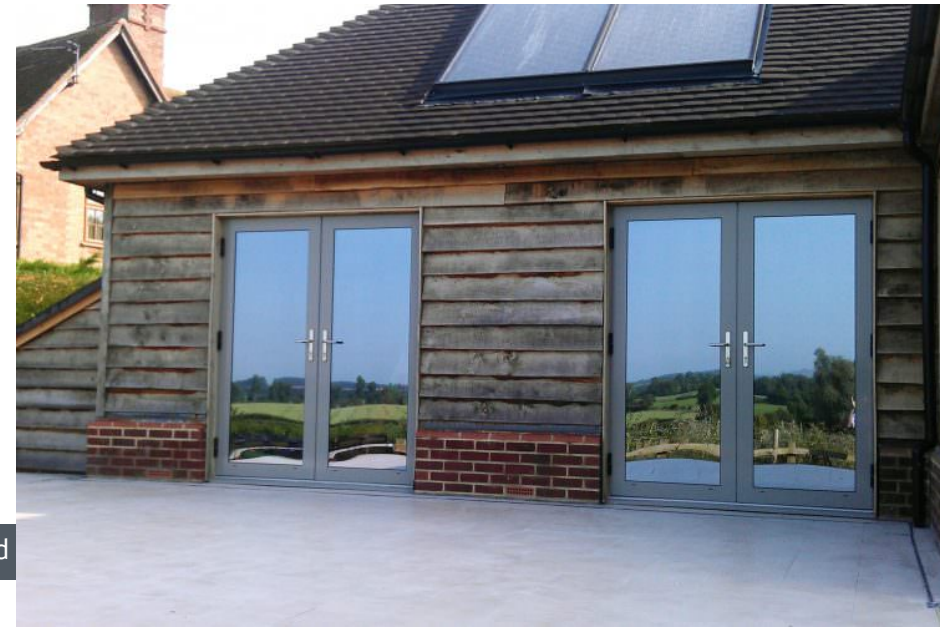
Create the architectural look and