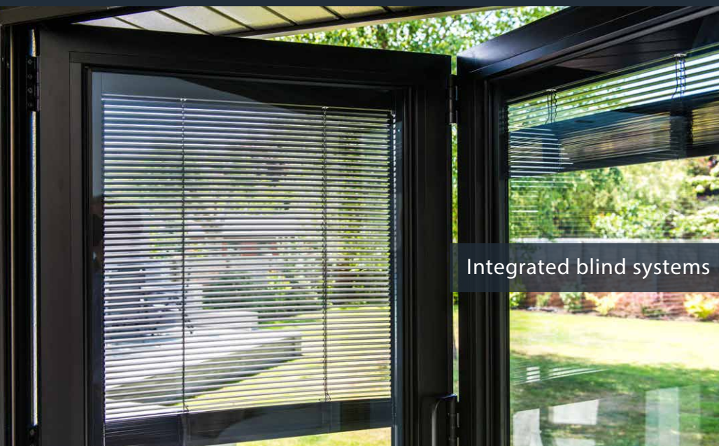
Integrated blind systems

Integrated blinds can be installed within our sealed glass units and are available in a range of colours to complement your windows, doors and decoration.