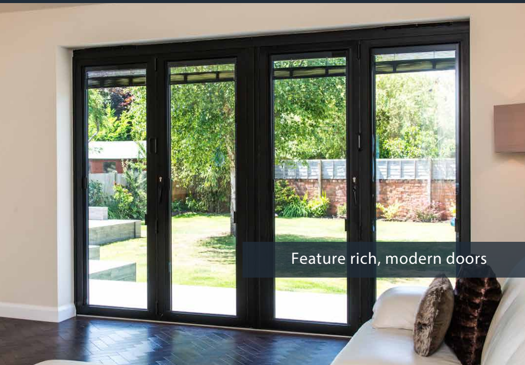
Feature rich, modern doors