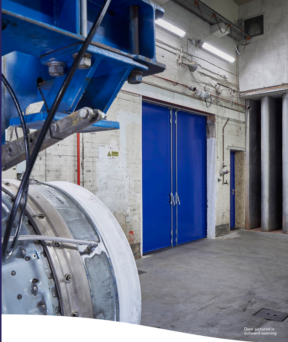
Door pictured is outward opening